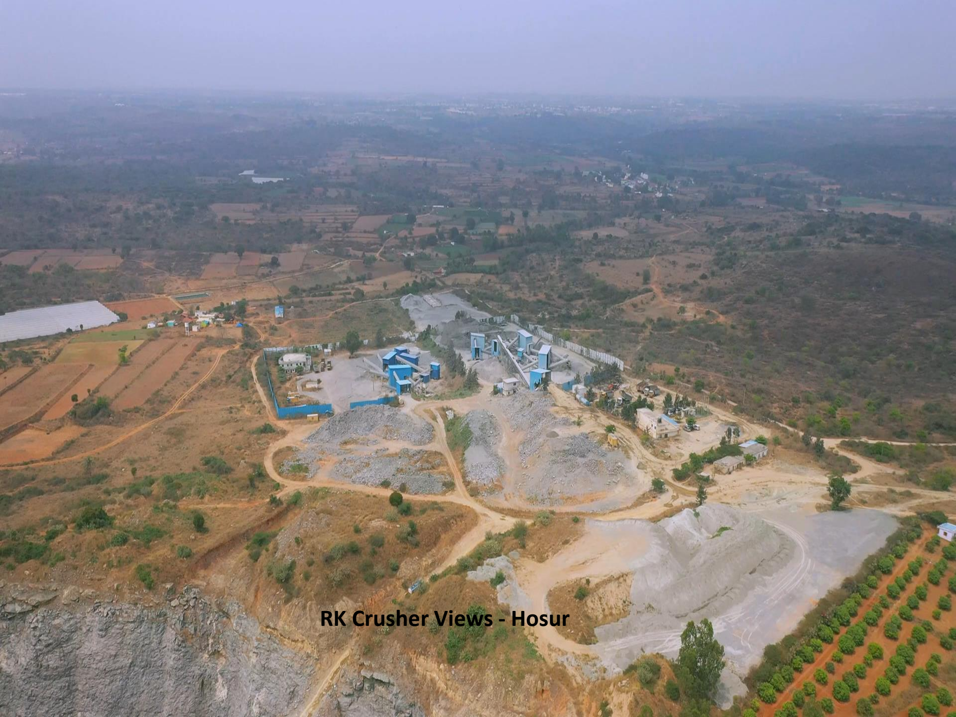
RK Crusher Views - Hosur