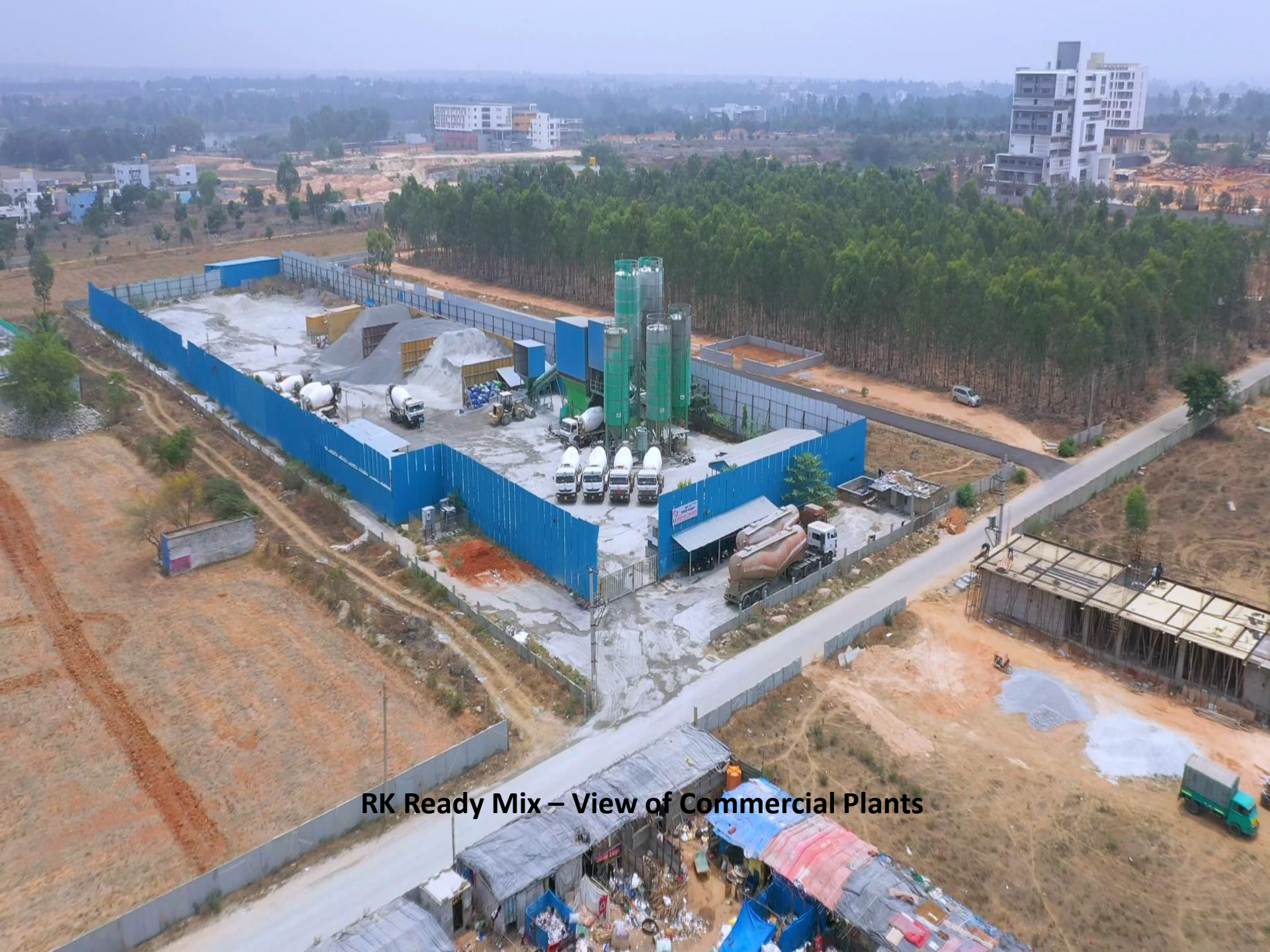
RK Ready Mix – View of Commercial Plants