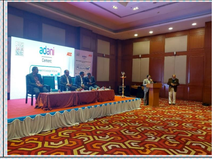
Lighting the Lamp