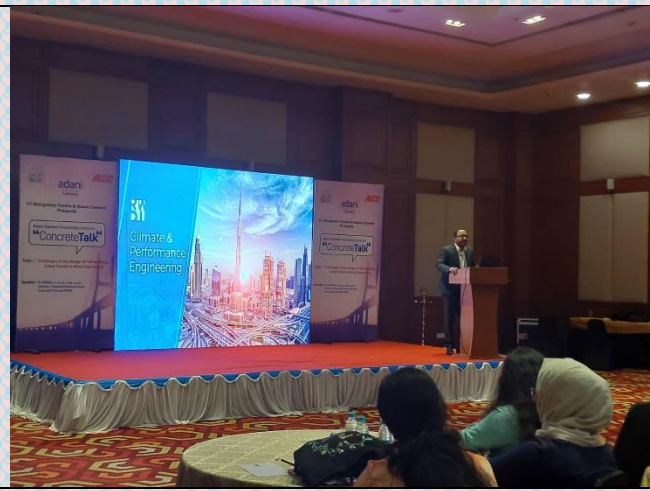
Audience present during the technical lecture.