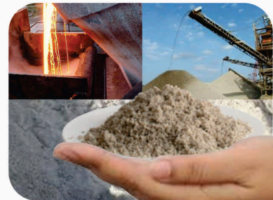
Manufactured slag sand

Indian Concrete Institute–Karnataka Bangalore Centre