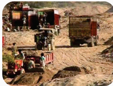
Natural River Sand