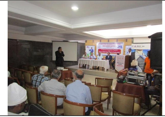
Interactive Q&A sessions