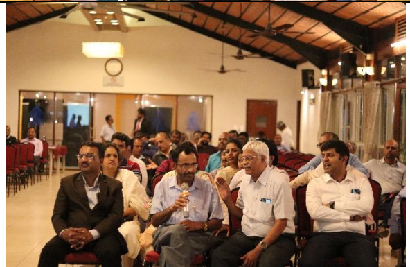
Glimpses of audience during the AGM 2023