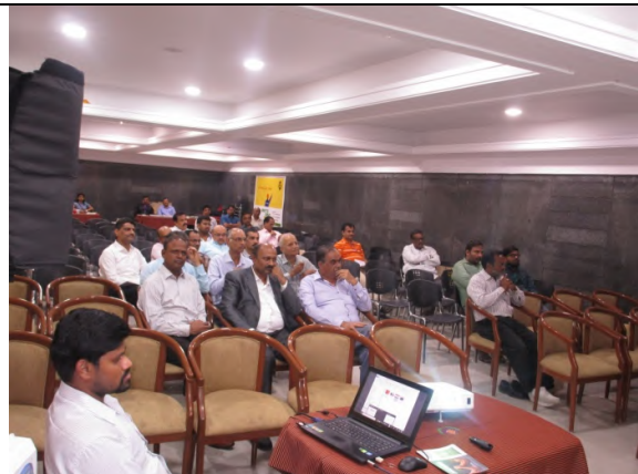
ICI - Bengaluru Centre, Members present during the AGM 2018