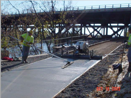
Sidewalks – no receivers