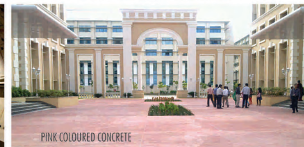
PINK COLOURED CONCRETE