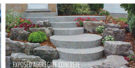
EXPOSED AGGREGATE CONCRETE