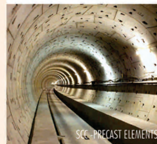
SCC - PRECAST ELEMENTS