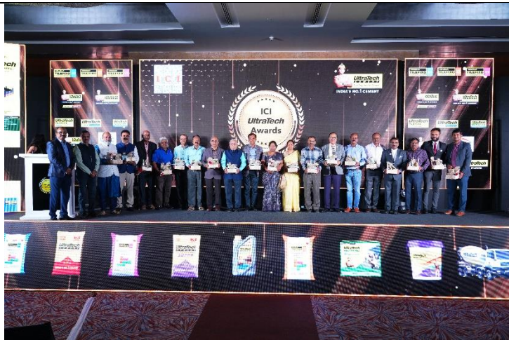
Jury Members 2023