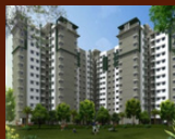
2016 - Provident Sunworth, Bengaluru