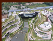
2018 - Titan Corporate Office, Bengaluru