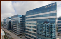
2021 - Oracle Tech Hub - Phase 1 & 2, Bengaluru