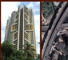
2015 - Brigade Exotica & Two Level Grade Separator, Bengaluru