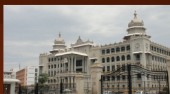
Vikasa Soudha, Bengaluru