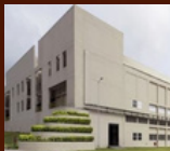
2020 - Himatsingka Siede, Hassan