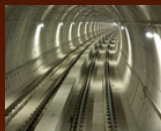
2016 - R-2 Phase 1 & UD-2