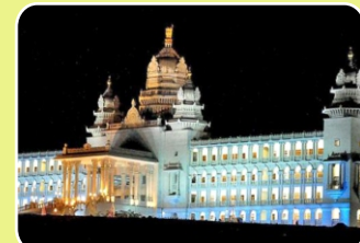
Vikasa Soudha, Bengaluru