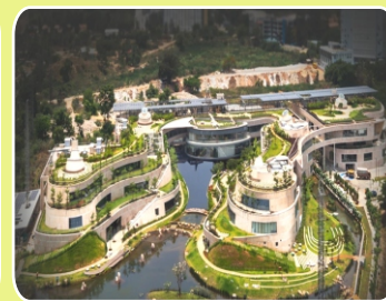
2018 - Titan Corporate Office Bengaluru