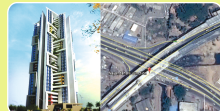
2015-Brigade Exotica & Two Level Grade Separator, Bengaluru