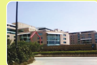
2009 - Pritech Park Phase II, Bengaluru