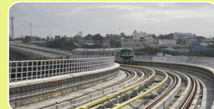
2014 - R3 Phase I, Bengaluru