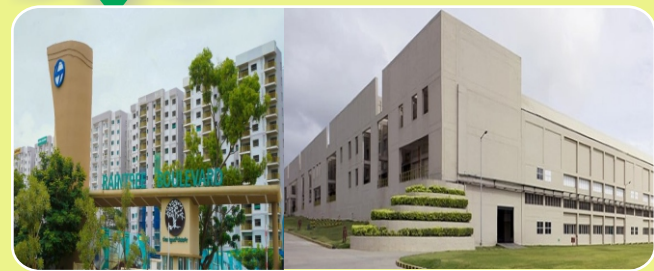
2020-L&T Raintree Boulevard, Bengaluru & Himatsingka Siede, Hassan