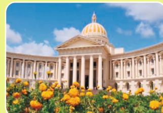
2010 - Infosys Campus, Mysore