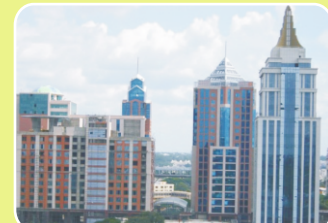
2008 - UB City, Bengaluru