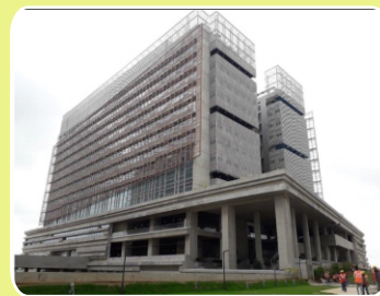
2019 - Wipro - IT SEZ Project, Bengaluru