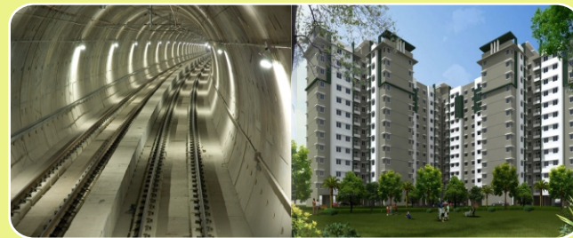
2016-R-2 Phase I & UD S-2 and Provident Sunworth, Bengaluru