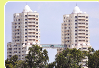
2007 - Beary's Lake Side Habitat Bengaluru