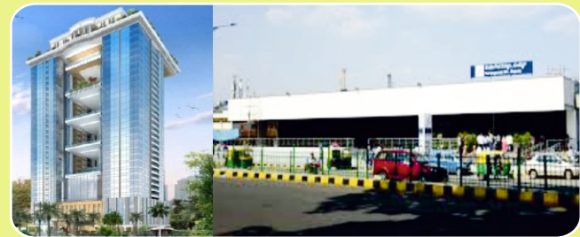
2017-King Fisher Tower, Majestic Underground Metro Station, Bengaluru