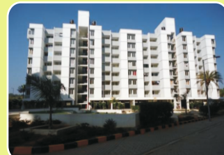
2014 - VBHC Anekal