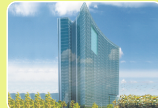
2011 - World Trade Centre