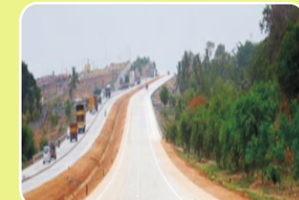
2013 - B'lore- Mysore Corridor Project