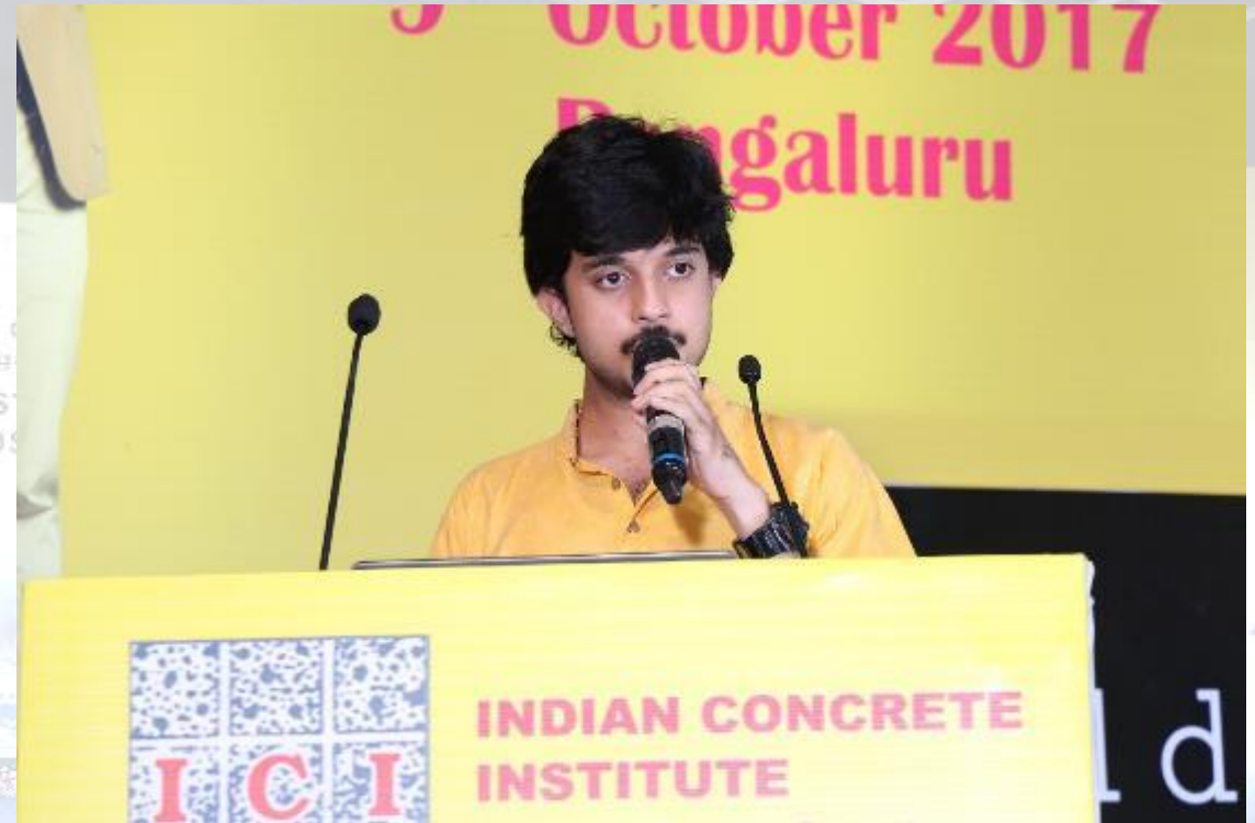
The Program starts with Invocation