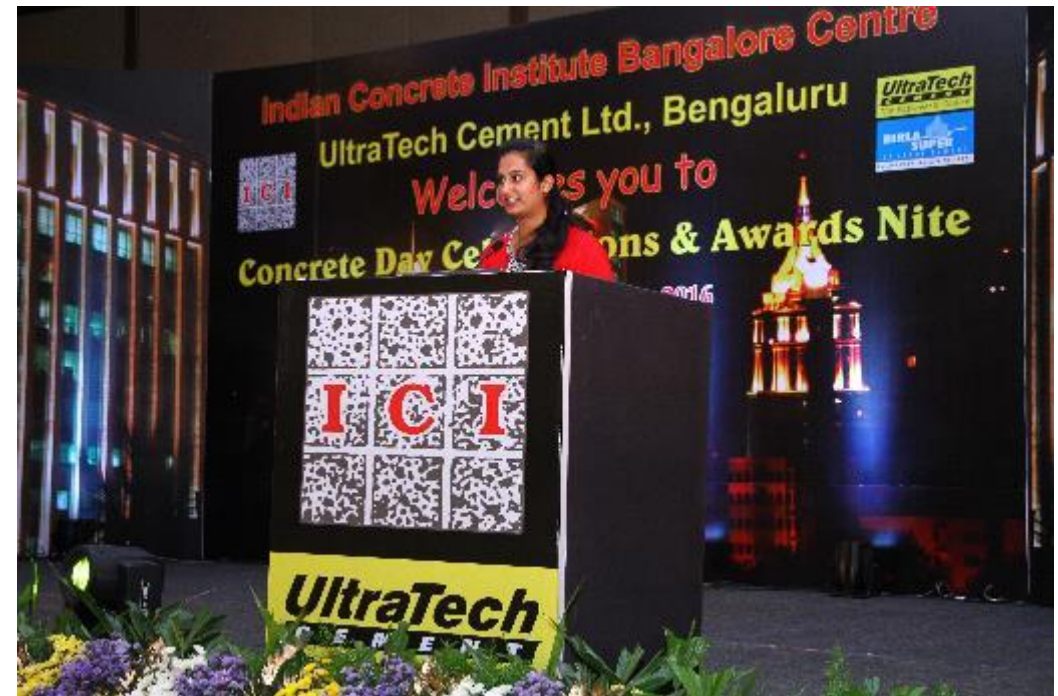
The Program starts with Invocation