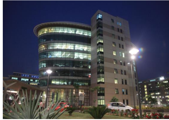
PRITECH PARK II - Devarabisanhalli Bellandur Road, Bangalore.

BRIGADE RUBIX - HMT Main Road Bangalore – by M/s. Brigade Enterprises Ltd Bangalore and Valagerahalli Phase-III, Kengeri Hobli Bangalore – by M/s. Bangalore Development Authority, Bangalore won - Appreciation Award 2014