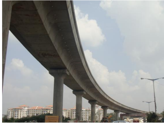
Elevated Viaduct between Yeshwanthpur station and Swasthik station - Reach R3 in Phase I of Bangalore Metro Project, Bangalore