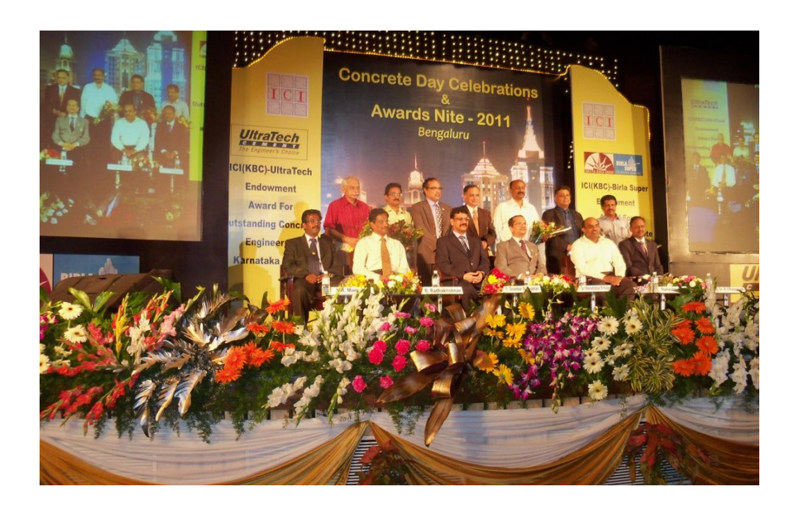
Group photo with the award committee for the concrete day 2011